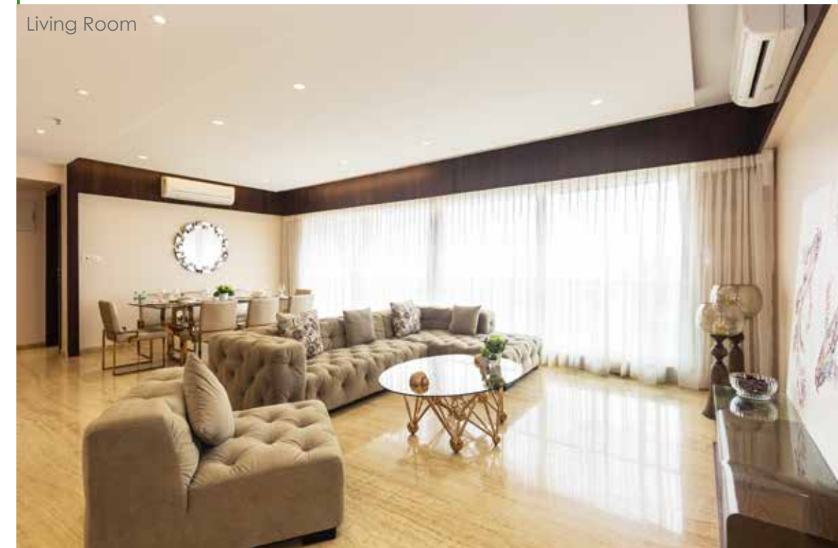
Living Room Show flat - * Shot on Actual Location * Actual Finishing & Sizes as per sales agreement * Image for depiction purpose only

Sumit Lata is a whole new novel approach to elegance, exclusivity and a serene lifestyle. Iconic architecture, sprawling layouts, unbeatable amenities, lush green spaces, meditative Jain temple and the most sought-after address in Sion makes a home in Sumit Lata more than a residence- it's life ensconced in luxury, and beyond description. It's an abode where good life begins!