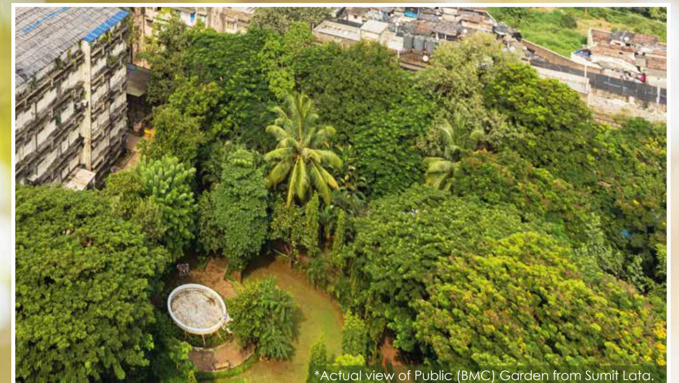
*Actual view of Public (BMC) Garden from Sumit Lata.